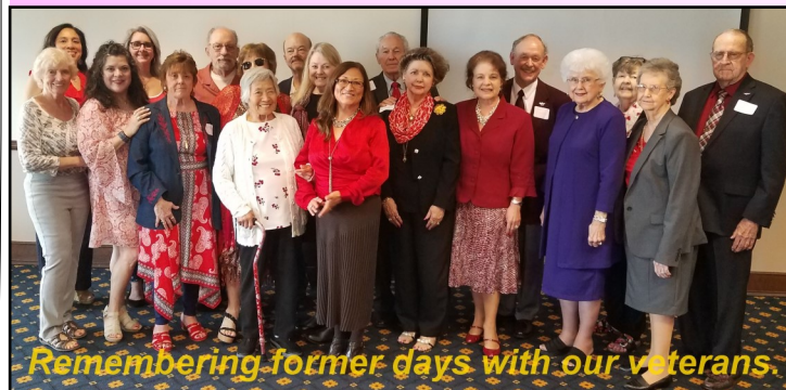
Remembering former days with our veterans.

May we offer prayer for our country to adhere to His standards. May your Thanksgiving be joyfully blessed! "In God we Trust" with "One Nation Under God."